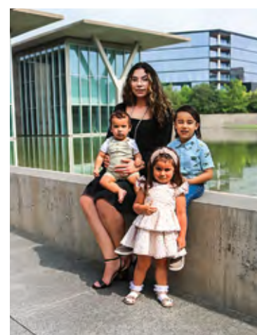
A single mom and her children will benefit from the 1,000th Build.

Construction on the 1,000th House Build is set to begin in the Hillside Morningside neighborhood in Fort Worth on Friday, Oct. 13 and will be completed by Saturday, Nov. 11. At least 20 volunteers are needed for each of the 12 full build days. Coordinators will also be needed for additional tasks.